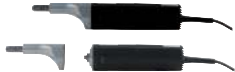
Saw head autoklavable