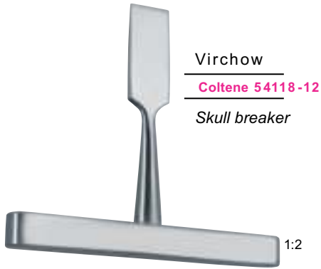
Virchow Coltene 54118-12 Skull breaker